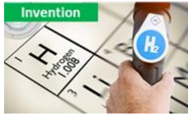
Using Hydrogen for a Net-Zero Future By Future Net Zero

The uses of hydrogen do not stop at transport – stationary fuel cells can also be used as a backup source of power and to supply electricity to remote locations, as well as to power portable equipment such as hand-held devices and generators.