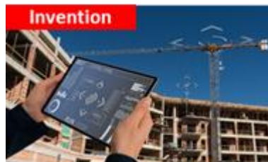
Improving productivity and quality through DfMA By PBC Today

The writer shared that Architects need to prioritise high quality design and placemaking. To achieve this with a manufacturing mindset, this we need to define the project's DfMA goals from the outset.