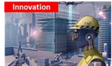
Benefits of digitalizing construction industry By Geospatial World

Explaining ideas to multiple collaborators results in long threads and it is hard to keep track of them. Digital technologies connect all stakeholders of the project in real-time, allowing them to see the progress at every stage ensuring the project gets completed in the given deadline. When collaboration is strong, team members pool their resources and knowledge and prioritize on meeting shared goals.