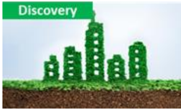
The Transition to Net-Zero Cities Starts with Collaboration. By World Economic Forum

To accelerate the move towards net zero carbon cities through the decade ahead, the WEF identifies some opportunities that need to be prioritised to enable systemic efficiency and they include: