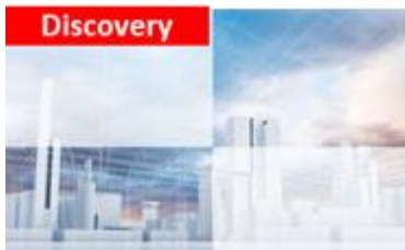
Smarter Planning and Design By World Economic Forum

During the COVID-19 lockdown, BIM was more widely adopted in the industry. It enabled projects to continue in a digital and virtual environment even when participants were unable to meet in person. This collaborative approach allows data to be shared across professional disciplines and businesses, and facilitates smarter construction.