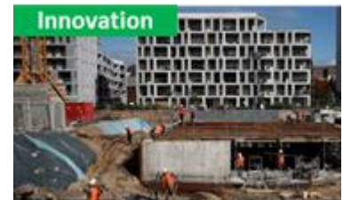
Better buildings are the foundation of the post-pandemic city By C40 Cities

The C40 Global Mayors recommends investing in green solutions during the COVID recovery period. Investing in new energy-efficient buildings and retrofits could provide huge emission reductions and cost-savings. Better buildings are also a means of delivering healthcare.