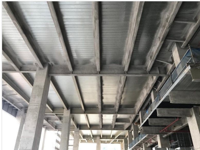
Figure 2: The Hybrid Precast Column-Structural Steel system used at the superstructure eliminated laborious on-site formwork erection to accelerate on-site works.