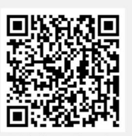
Get the latest information and advisories for MCSTs on COVID-19