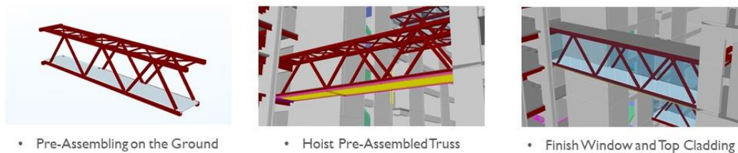
Illustration B: Link Bridge Erection

being hoisted and placed in position on temporary supporting corbels before final connections were made safely. This allowed the project to be constructed within a constrained space, reducing disamenities and minimised the need for working at height, improving the safety for those on site.