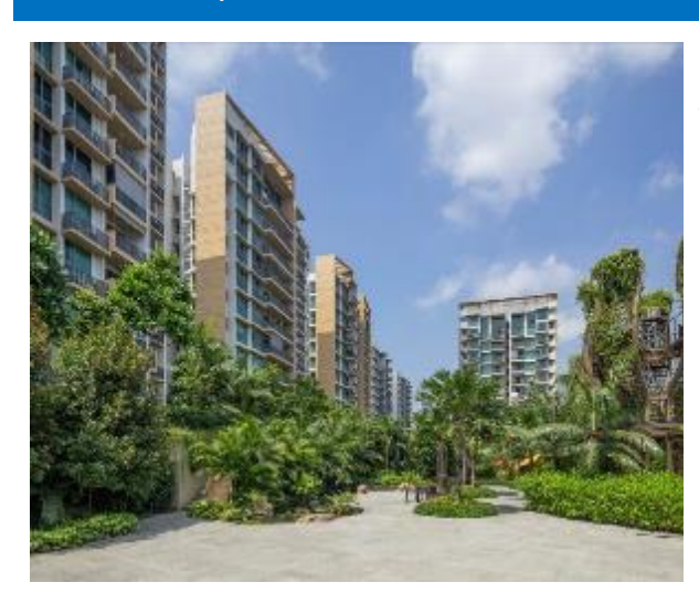
The Glades Residential (New) (UD Mark V1.0 – New)

Owner / Developer China Vanke & Keppel Land JV