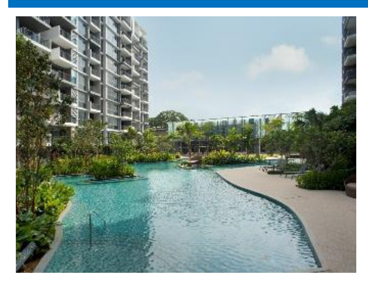
The Visionaire Residential (New)

Owner / Developer QingJian Realty (Sembawang) Pte Ltd