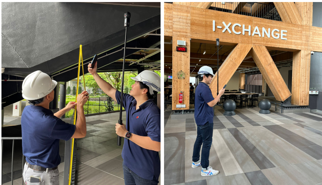
Picture 1 and 2: Virtual inspections can be done using 360 capture devices to record site findings

In summary, the adoption of the 360 Capture platform for site inspections holds the potential to enhance construction industry inspection processes, making inspections safer, more efficient, and more effective.